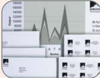
Superb quality printing on a wide range of paper types, transparencies and envelopes